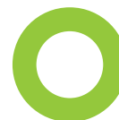
NEW LIFE GREEN

Pantone 375 C47 M0 Y100 K0 R149 G201 B61 HEX 95C93D